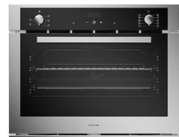
Oven KE 75 7137 000