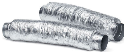
Flexible silencing canalization 9700 602