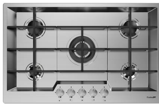
Cooker hob KE 7602 032